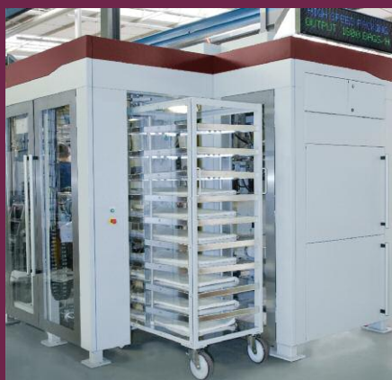
Space-saving vertical empty bag magazine